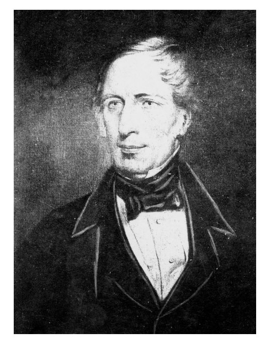
Image courtesy of the State Library of South Australia - SLSA: B456 Captain Sturt

On the 14th December with the temperature well into the century, Gawler and his horse could not proceed,