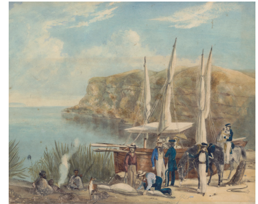
servants tent, 1 sa SLSA: PRG 50/34/6 Junction of the Murray and lake Alexandrina half tons in total.

The expedition made its way from Adelaide on 22nd November 1839 with some on horseback and others in the