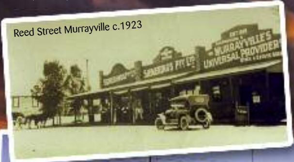
Reed Street Murrayville c.1923