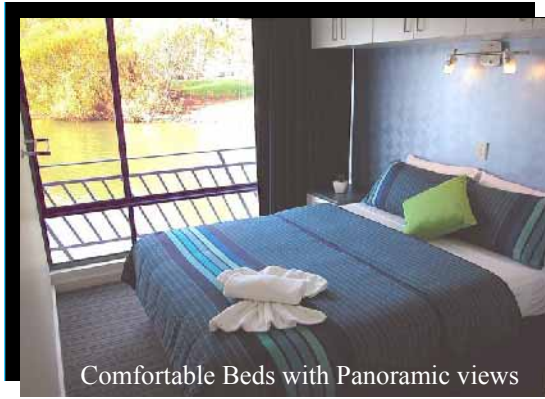
Comfortable Beds with Panoramic views