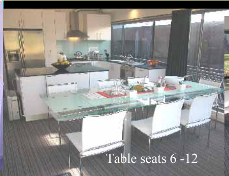
Table seats 6 -12