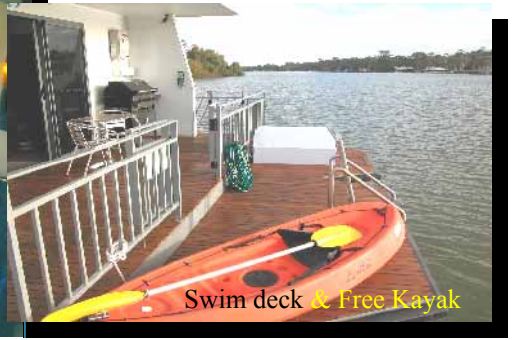
Swim deck & Free Kayak