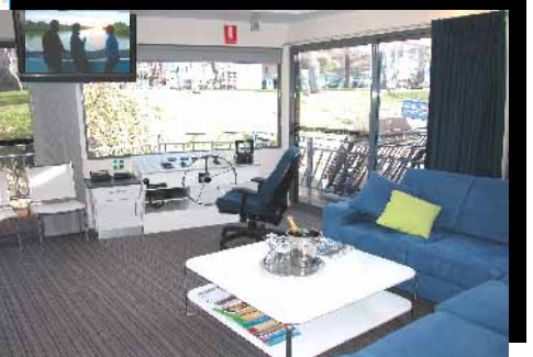
Helm, Lounge & Surround sound home theatre