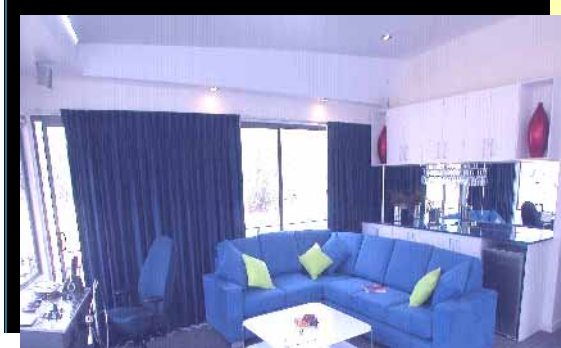
Helm, Lounge and Mirror Bar