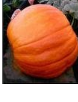
This could be you!!!

Cadell Easter Harvest Festival Harvest, 3rd April 2010