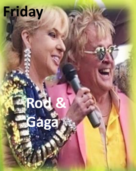
Rod & Gaga