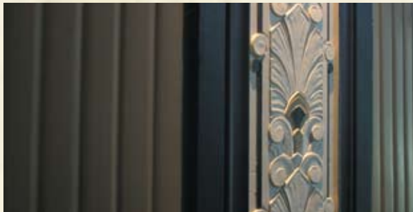
1. Mildura Brewery