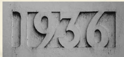
7. Power Supply Substation