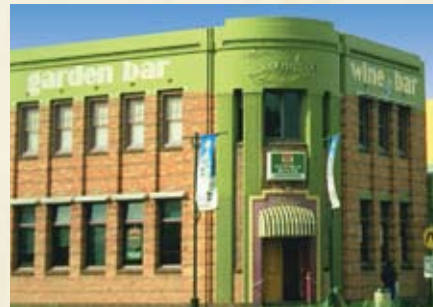
3. Former Commercial Bank of Australia