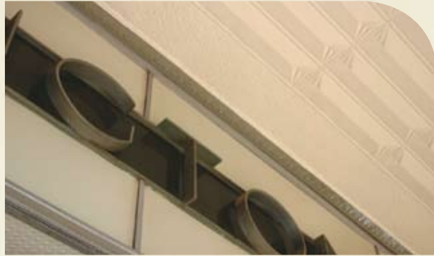
8. Etheringtons the Jewellers