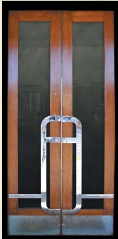
8. Etheringtons the Jewellers