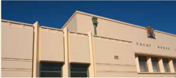
Red Cliffs Courthouse