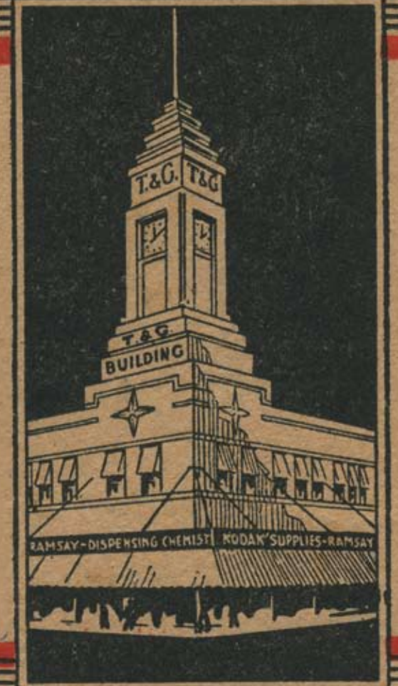
Cover Image: Shows the distinctive tower from an advertising poster for Kodak supplies.