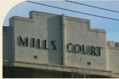
5. Mills Court

A modernisation of many different artistic styles and themes from the past, it borrowed from Far and Middle Eastern designs, Greek and Roman themes, Egyptian and even Mayan influence. It emphasised abstraction, distortion and the simplification of geometric shapes and intense colours.