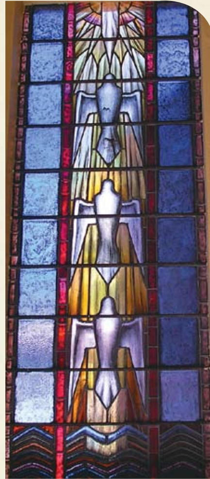
9. The Mildura RSL