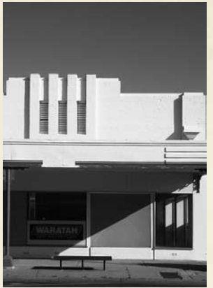
Formerly Bowring's Department Store, Merbein

To assist you to recognise Art Deco buildings, typical architectural features may include: