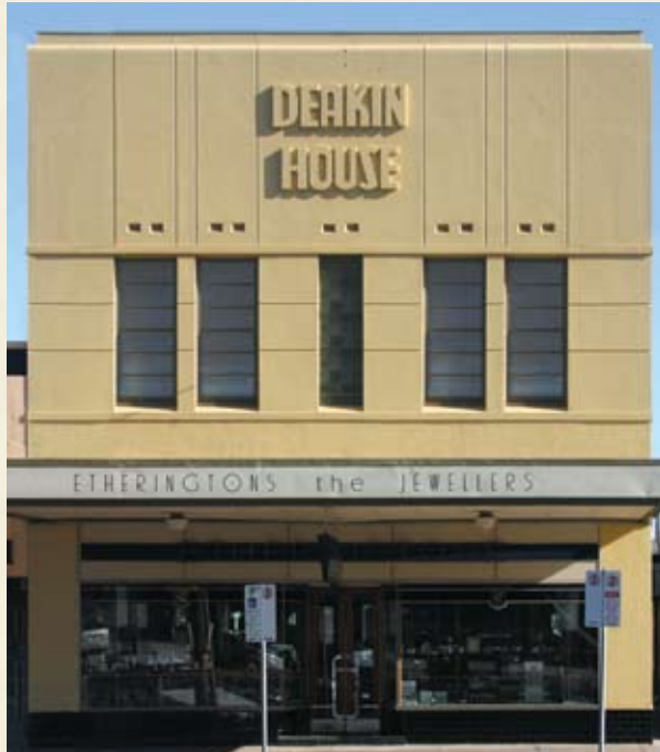
8. Etheringtons the Jewellers