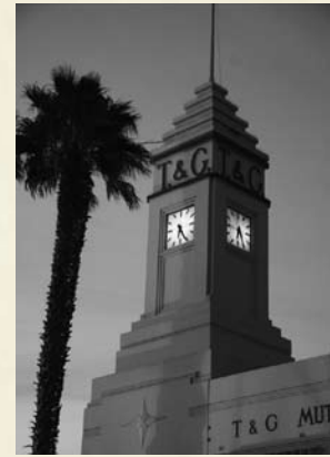
4. The T&G Tower